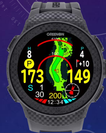
GREENON GPS Caddie A1-II