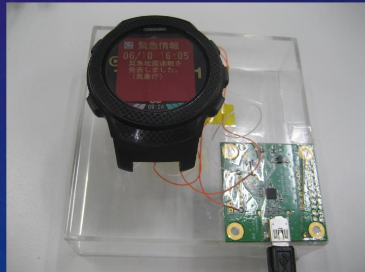
Images of the simulator