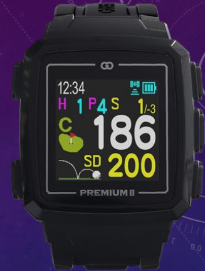
GREENON GPS Caddie PREMIUM II